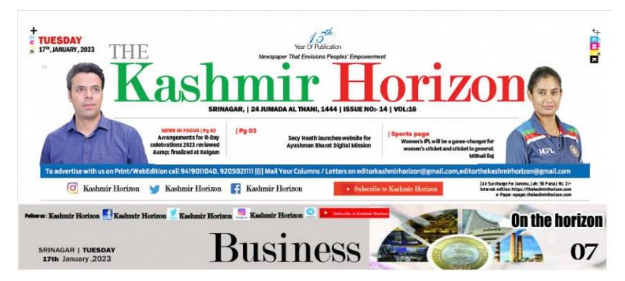
Tuesday, 17 January 2023