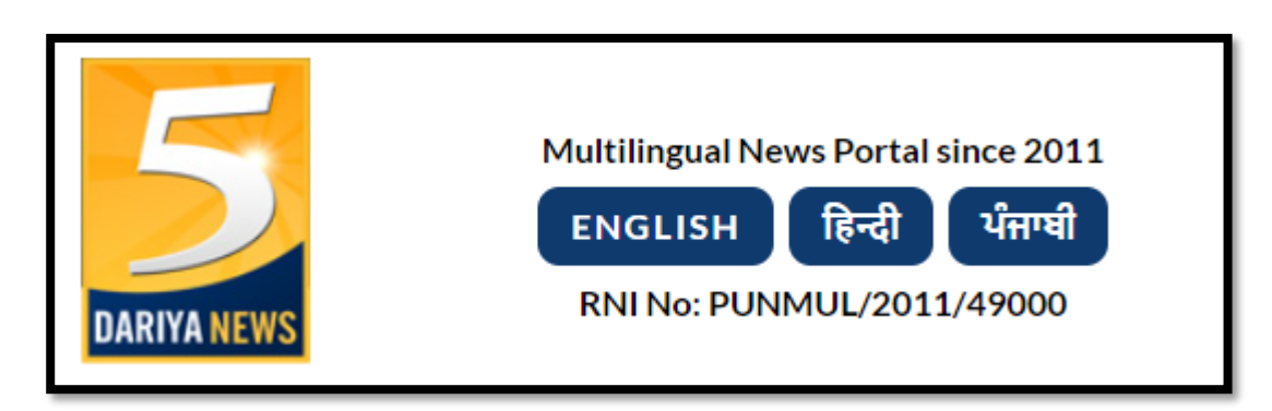
Tuesday, 17 January 2023